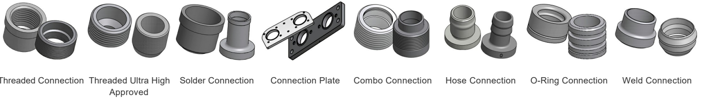
Threaded Connection Threaded Ultra High Approved Solder Connection Connection Plate Combo Connection Hose Connection O-Ring Connection Weld Connection

*For specific dimensions, or information about other types of connections, please contact your SWEP sales representative.